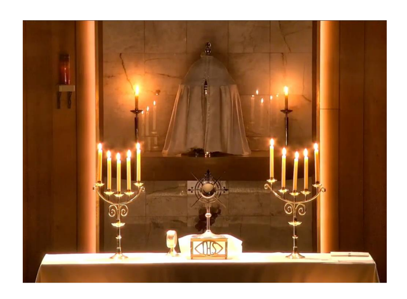
St Joseph's Riverwood