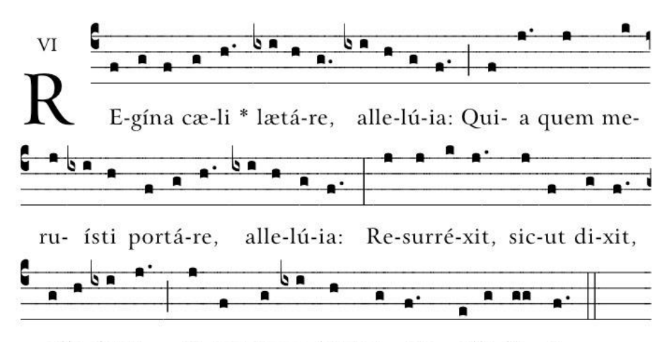
alle-lú-ia: O-ra pro no-bis De- um, alle-lú- ia.

Queen of heaven, rejoice, for He whom thou didst merit to bear, hath risen, even as He said: pray God for us.